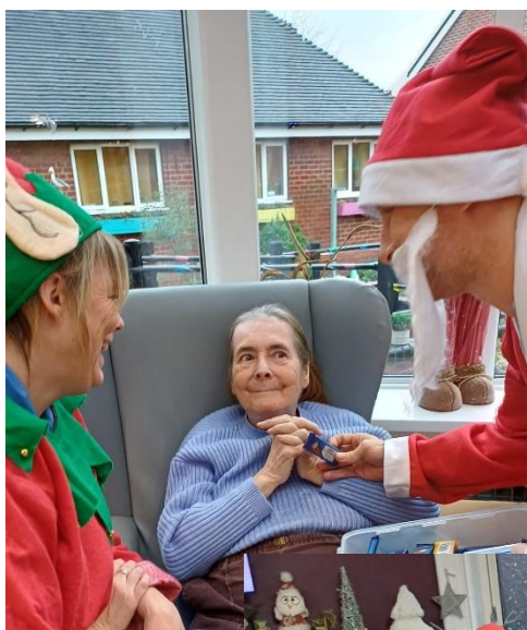
Santa came to town, well The Grove, to give out chocolate and have a little dance